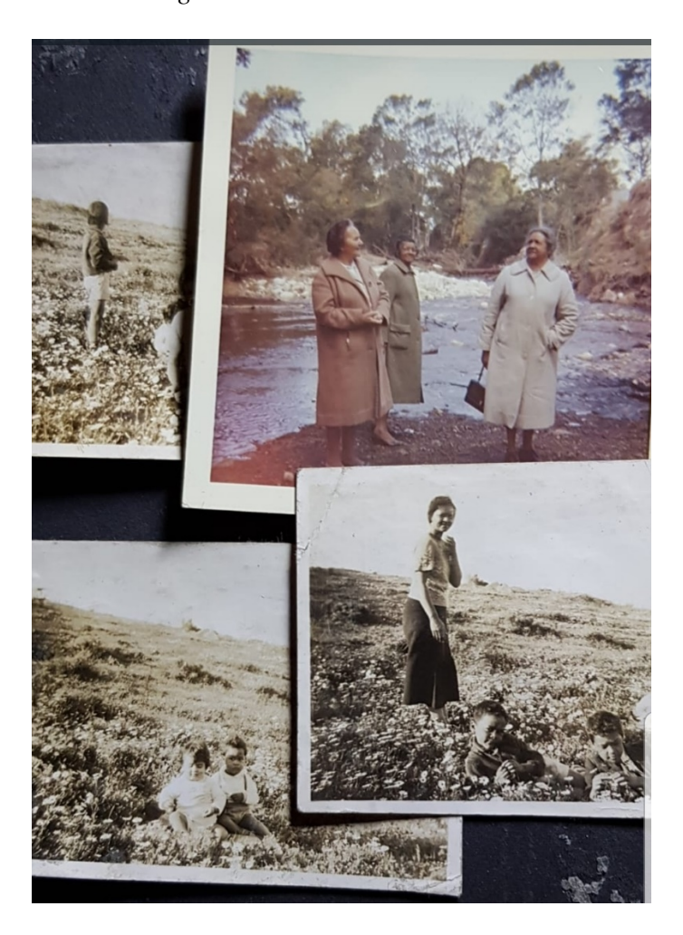
Figure 1 Photo Collage on Ancestral Climate Care

Note: Photos from author's paternal family ~ 1960's