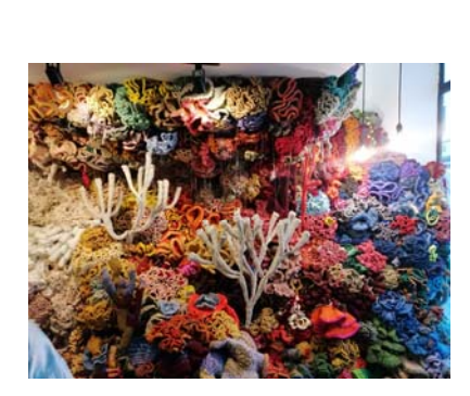
Figures 1, 2 and 3 Pictures of the Emphatheatre Crocheted Coral Reef

Some members of Emphatheatre were also involved in an exhibition of a huge crocheted coral reef that took 12 years to create, and was made lovingly by hundreds of citizens across South Africa (see figures 1, 2 and 3 below). It is one of many exhibitions across the world, and 'holds a powerful symbolism and figuration of solidarity in times of climate change.' In front of it, on the floor, sat some women busy crocheting further pieces to add, reminding us that while real reefs are under threat of dying from bleaching, there are some humans who are countering the threat by demonstrating symbolic support to help reefs to grow. It was the most moving piece of art and craft I have seen for a long while – enhanced by the atmosphere in the room: buzzing with mainly young people, there was laughter, agitated conversations, warm embraces and greetings. It was as if the ocean reef had us all under a spell of vibrant life.